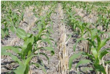
Maize grown through zero-tillage approach

Minimal Soil Disturbance: The practice of ploughing the field (or tillage) to prepare for sowing or seed bed preparation has been in vogue since times immemorial. Farmers have perceived that tillage or soil loosening would improve soil fertility, increase its ability to absorb rainwater, and help in controlling unwanted weed flora. In this manner, tillage practiced over the years has led to accelerated oxidation, resulting in reduction in soil's organic matter content, finally leading to reduced overall productivity.