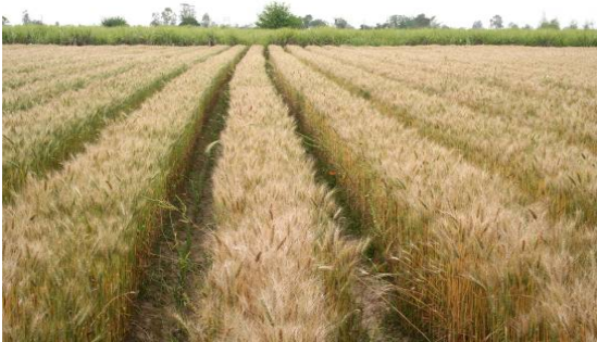
Wheat intercropped with sugarcane

Diversified Crop Rotation: When plant residue is not burnt and soils are not ploughed; control of pests, diseases, and weeds has to be achieved through crop rotation and an integrated pest management approach. Such crop rotation practice interrupts the infection chain between subsequent crops and offers a “diet” to soil micro-organisms. Crop rotation also promote exploration of nutrients by crops from different soil layers and helps in reducing pressure created by mono-cropping. Thus, crop rotation functions as a biological pump to recycle the nutrients. The resultant higher microbial activity stimulates nitrogen fixation and humus formation with an objective to complement natural soil biodiversity and create a healthy soil micro-environment. Pursued scientifically as part of CA practice, this option has much to offer to the cause of soil health.