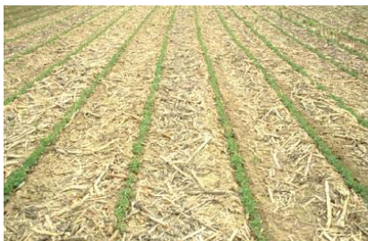
Crop residue maintained on the soil surface

CA practices, viz. minimal soil disturbance and retention of crop residues on soil surface, adopted over time help modify soil characteristics in a number of ways that are beneficial to sustained productivity. Crop residues when left on the soil surface result in a kind of soil skin that provides food and shelter to micro and meso flora thereby increasing soil biotic load and biological activity. Soil cover helps the surface layer to become a habitat for a number of organisms from larger insects to soil borne fungi and bacteria. These organisms gradually decompose the residues that in turn result in stabilizing soil structure. The larger component of soil fauna such as earthworms further create macro-pores from surface to lower layers of soil, greatly increasing the capacity of soils to absorb and transmit water to lower layers, increasing water supply to crops during drier periods.