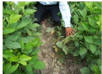
Soyabean in surface residue managed plot

The mulch layer plays an important role in improving biological activity, soil organic matter content, and in turn helps improve physical, chemical, and biological soil properties. However though CA advocates this approach, many socio-economic factors will govern its adoption, given the opportunity cost attached to crop residue.